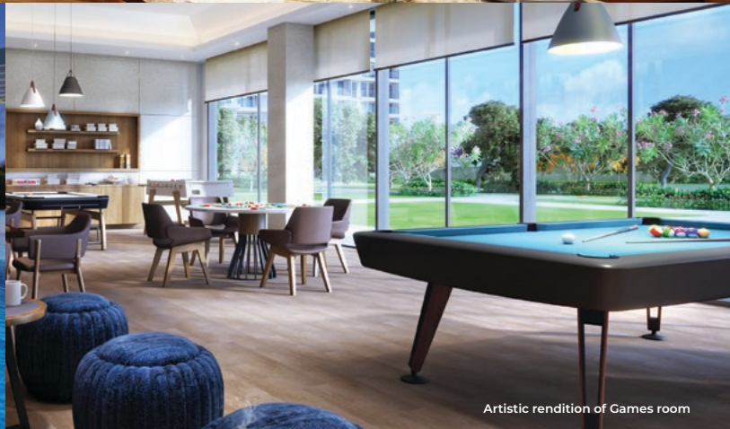
Artistic rendition of Games room

The elements of a luxurious lifestyle come together with a quality of life, rarely found in a bustling metro. DLF brings you a vibrant lifestyle that blends an abundance of nature with the joy of community living. This is the Capital city, like you've never seen it before.