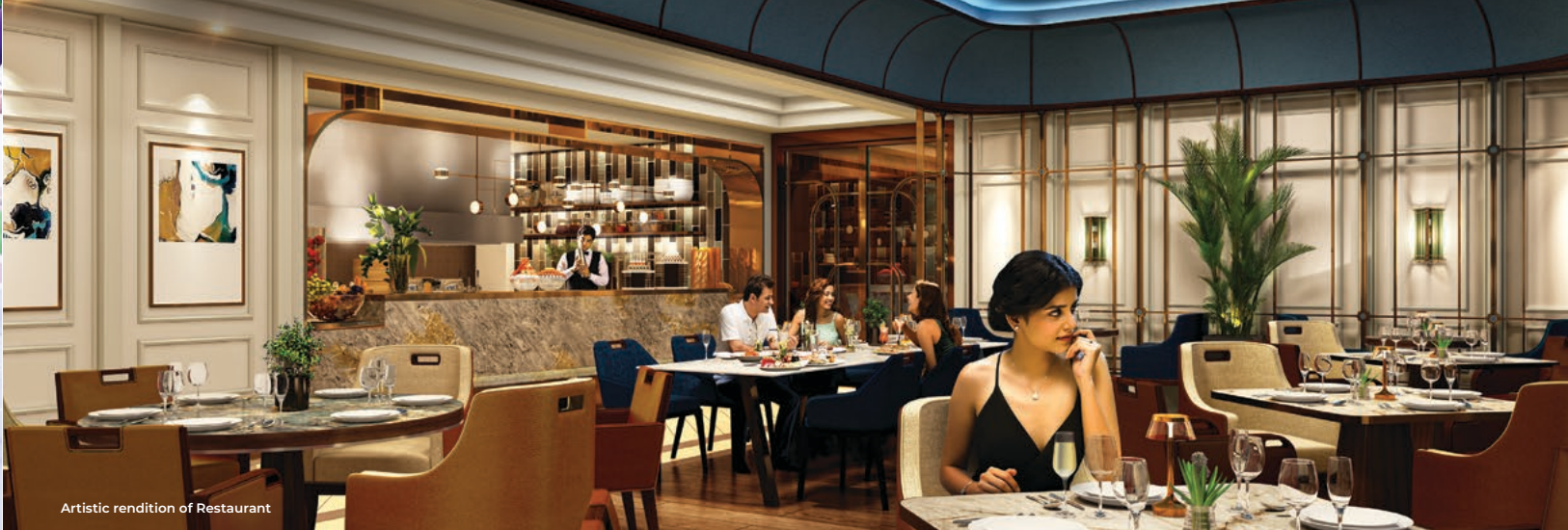
Artistic rendition of Restaurant