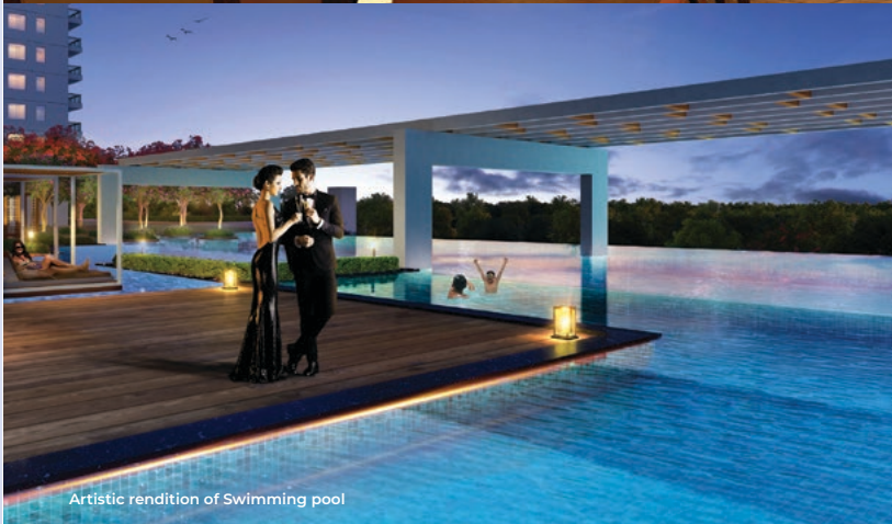
Artistic rendition of Swimming pool