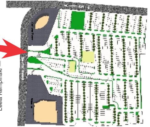
Surface Parking III