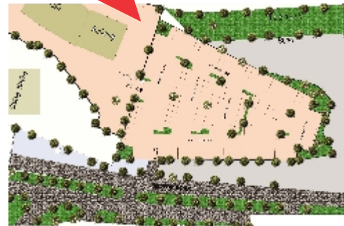
Surface Parking V