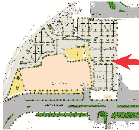
Surface Parking IV